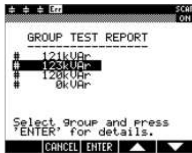
Figure 3: Group Test Report Screen