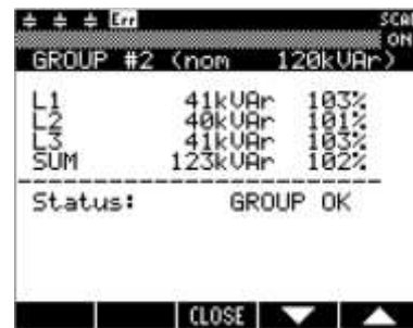
Figure 4: Group Details Screen - Group OK