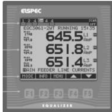
Figure 1: measuring screen