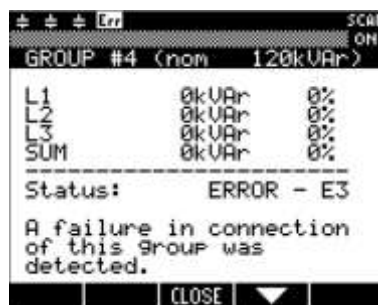
Figure 5: Group Details Screen - Group with Error 3